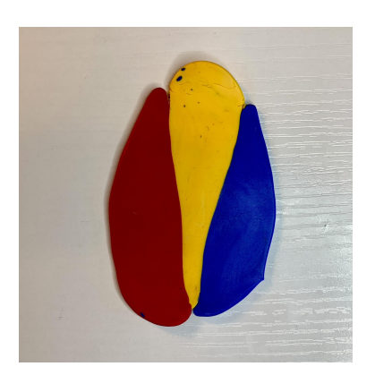
3. Using your Acrylic rolling pin, roll the clay out to 2-3 mm thickness