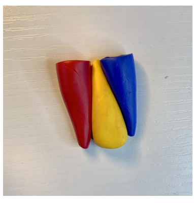
2. Place the three pieces next to each other, like the teeth on a zip- Left and Right facing up, with the middle piece facing down. Squeeze the clay lightly together.