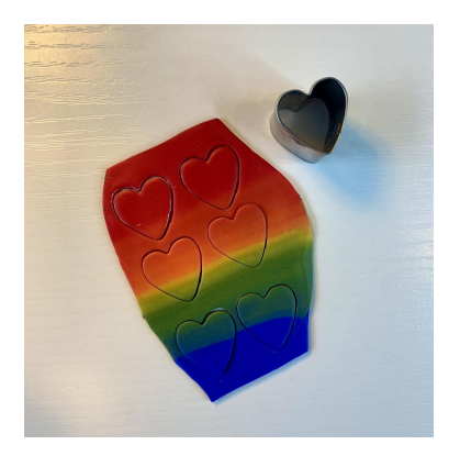
6. Take care with your cutter positioning if you want your earrings to match perfectly, If you don't, select any piece of the clay you prefer.