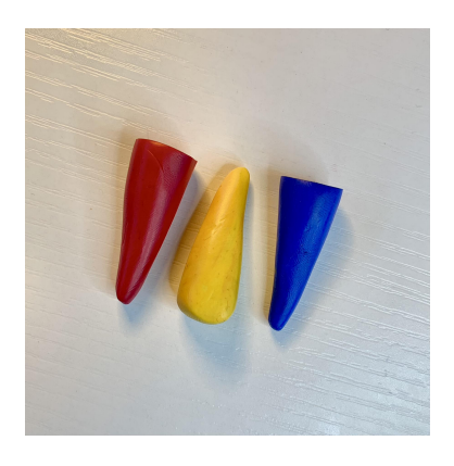
1. Select 3 colours of clay and roll them into short sausages. With your fingers put extra pressure on one end of the sausage to form a cone shape.